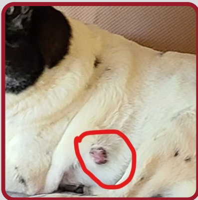
Cutaneous mass of the left lateral thorax

Comments: The HT Vista result gave the owner confidence in moving forward with surgery, especially since the patient previously had a poor surgical recovery.